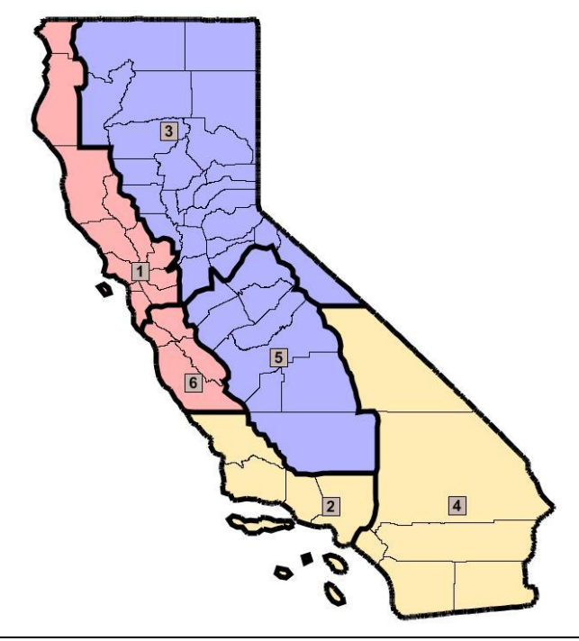
* Blue areas would elect in 2012 and every three years thereafter. Red areas in 2013 and every three years thereafter. Yellow areas in 2014 and every three years thereafter.